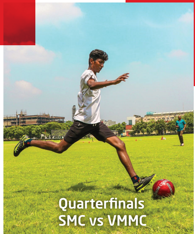
Quarterfinals SMC vs VMMC