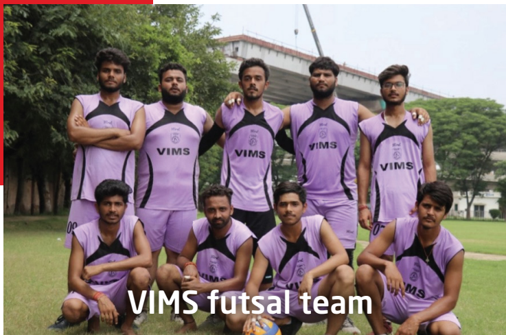
VIMS futsal team

The enthusiasm of the former sport had not even faded and the girl athletes who demonstrated exemplary sporting skills, strength and stamina in the game of “Kho-Kho” grabbed everyone’s attention. Runners and chasers of all the teams put their best foot forward to claim the prize. Everyone went on cloud nine as our university secured all the positions.