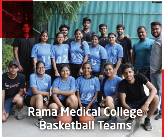
Rama Medical College Basketball Teams

"Volleyball" was also conducted at the former venue. The home team possessed a knack for this sport. After a real nip and tuck SMC-BMLT won the top prize followed by SMC 3rd year. Jamia bagged the first position amongst girls. Santosh Deemed To Be University was the runner-up.