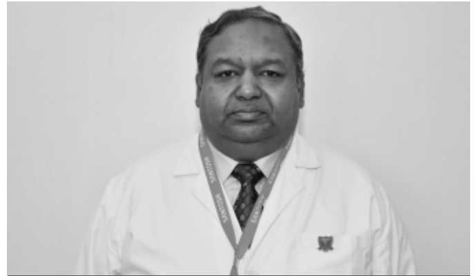
CONTROLLER OF EXAMINATION

The examination system is one of the pillar of an institution which incessantly strives towards the betterment of students' potential and their knowledge to ensure that each student brings laurels to the institution and shines bright in his/her field of study. Our main objective is that students graduating from Santosh Deemed to be University shall stand tall and undeviated at any step forward during their medical career using their expertise and best capabilities accepting any sort of unprecedented challenge/s, whenever required.