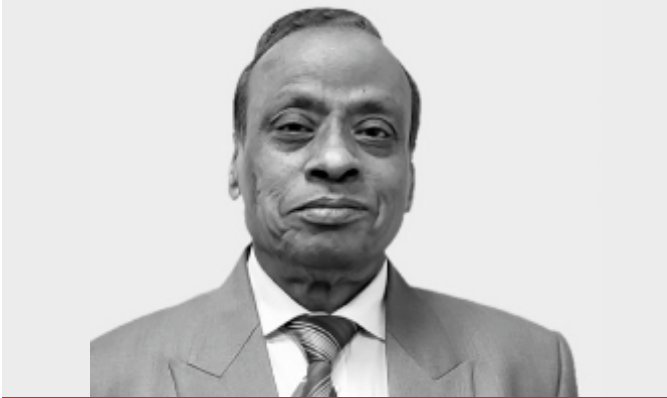
DIRECTOR ACADEMIC ADMINISTRATION

I, with immense pleasure, welcome you to the Santosh Deemed to be University, Ghaziabad, Delhi-NCR where your journey starts towards an important goal to become a good Doctor to serve humanity. Santosh Deemed to be University serves as a unique Institution delivering quality Medical, Dental education and services with a smile. Several Institutions function under the auspices of Santosh Deemed to be University providing excellent academic and infrastructural facilities.