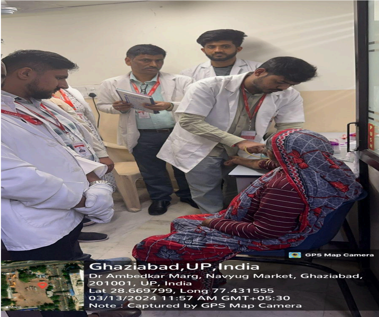
Ghaziabad, UP, India Dr Ambedkar Marg, Navyug Market, Ghaziabad, 201001, UP, India Lat 28.669799, Long 77.431555 03/13/2024 11:57 AM GMT+05:30 Note : Captured by GPS Map Camera