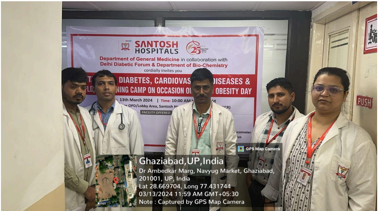
Ghaziabad, UP, India Dr Ambedkar Marg, Navyug Market, Ghaziabad, 201001, UP, India Lat 28.669704, Long 77.431744 03/13/2024 11:59 AM GMT+05:30 Note : Captured by GPS Map Camera