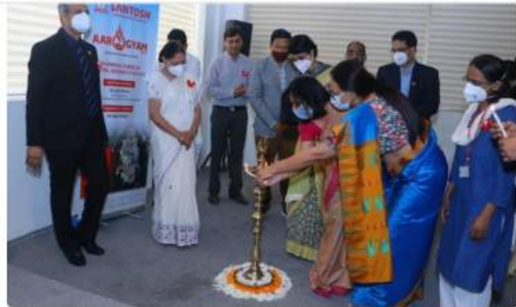
The inaugural ceremony at Santosh Deemed to be University's research and innovation initiative, Aarogyam